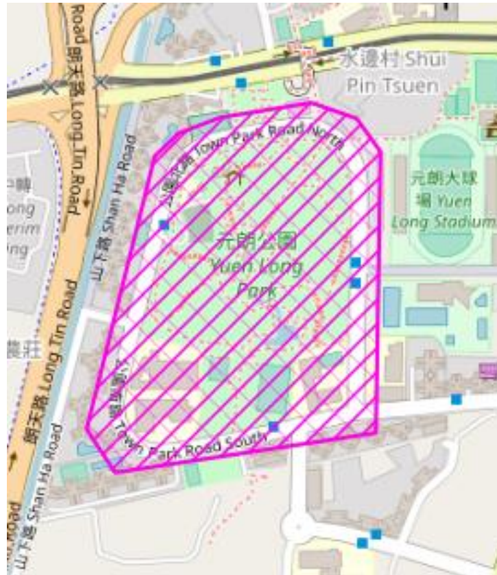
Map A. Embargoed area 圖 A. 封場範圍